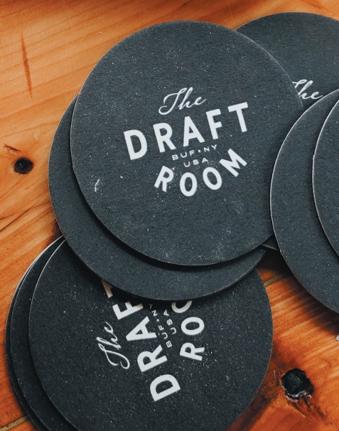
The Draft Room