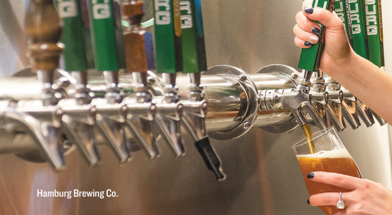
Hamburg Brewing Co.